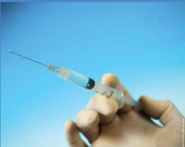
The rosy periwinkle and other plants of the world's ecosystems provide lifesaving medicines.