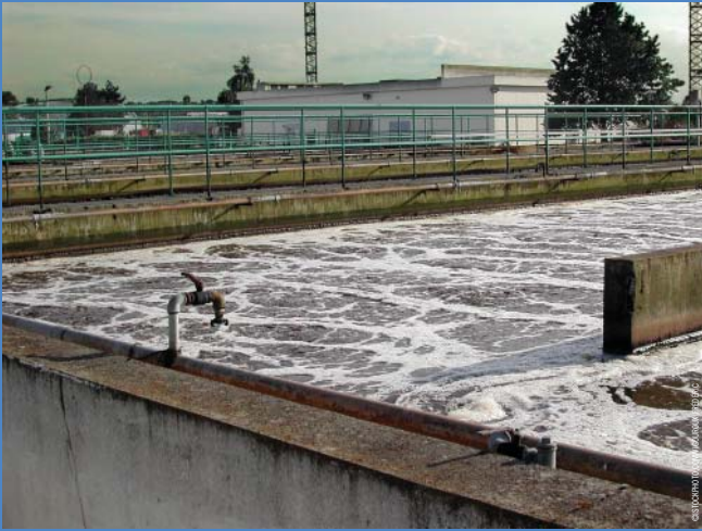
Forests in the Catskill Mountains are a natural water purification system for New York City.