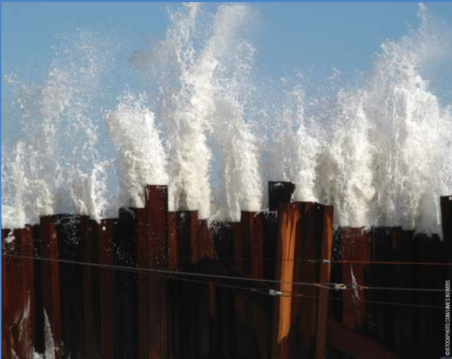
Coral reefs are natural sea walls, protecting coastlines in the tropics.